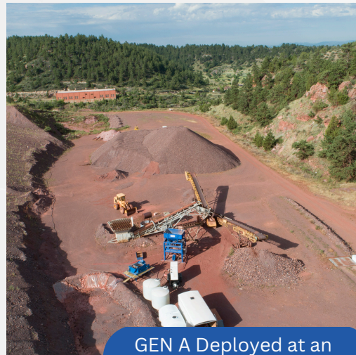
GEN A Deployed at an Iron Tailings Site