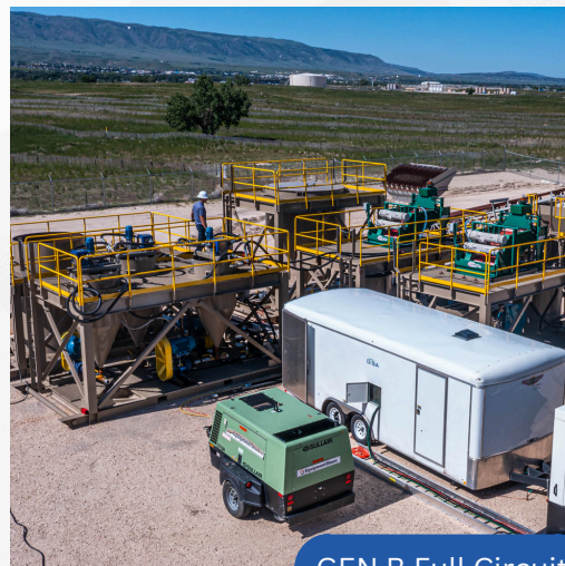
GEN B Full Circuit